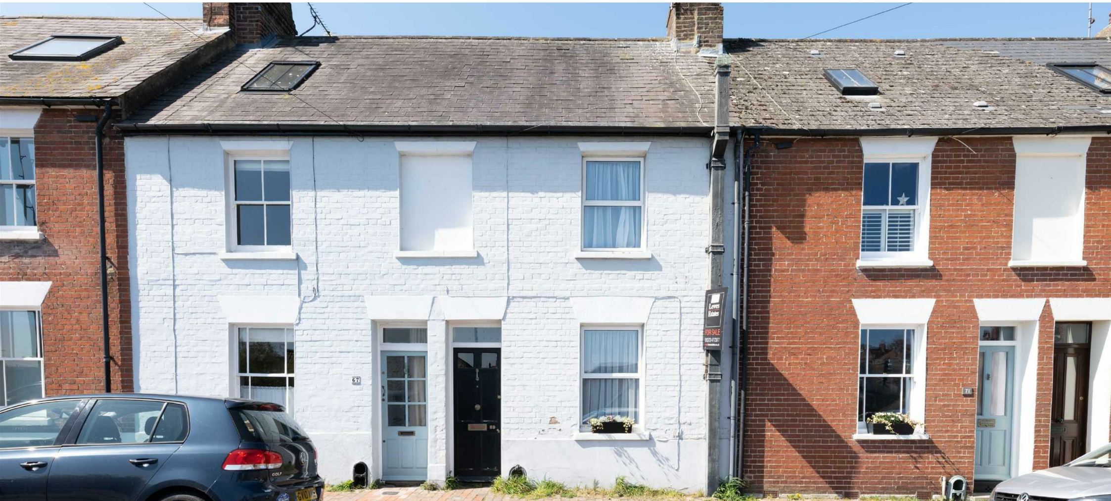
Valence Road, Lewes